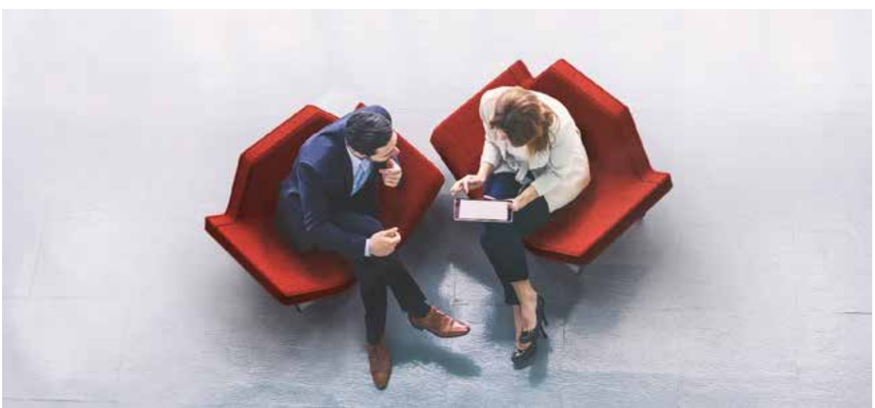
Sources: ONS (2020) https://www.ons.gov.uk/employmentandlabourmarket/peopleinwork PWC (2019) https://www.pwc.co.uk/women-in-technology/women-in-tech-report.pdf

Exertis are working to attract, select and develop females into the organisation by creating an inclusive environment where employees can thrive. Some of these changes can be reviewed in our positive steps.