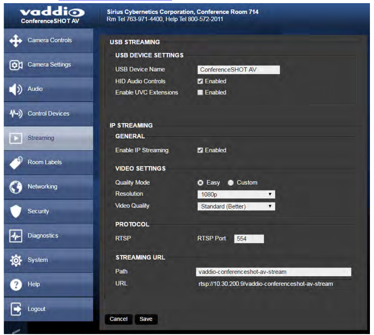
After making changes on this page, save them.