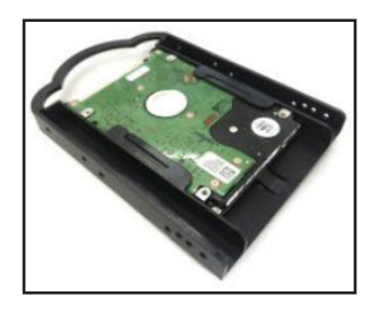
Inserting a Hard Drive into the Mounting Bracket