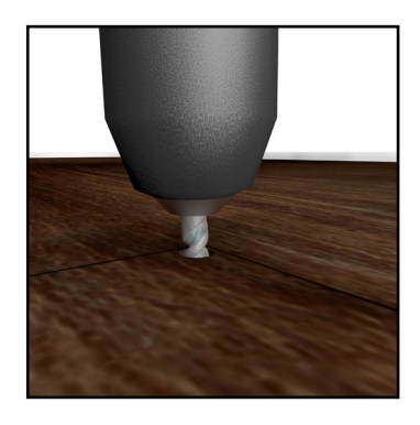
Drill Pilot Holes

5. Using a Drill with a 3/8" Wood Drill Bit , carefully drill pilot holes in each of the four corners of the guide.