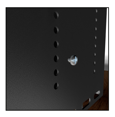
Inserting Module Screws

Note: The eight Module Screws are packaged with the Module .