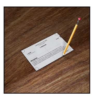
Surface Cut-Out Area

Using a Writing Utensil, trace around the Surface Cut-Out Area to create a guide on the table's surface.