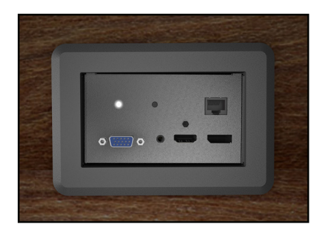
Modular Table Box

Secure the Modular Table Box in place by tightening each of the Wing Fasteners until the top of the nut comes in contact with the bottom of the table's surface, creating a tight seal between the table's surface and the Modular Table Box. Be careful not to overtighten the Wing Fasteners.