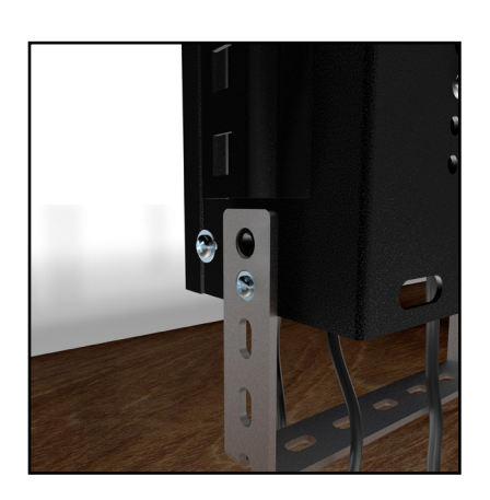
Installing the Lacing Bar

Note: The Modular Table Box has three Lacing Bar mounting options (left, center, and right). Mount the Lacing Bar in the position that best suits your needs.