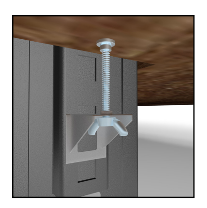
Installing the Wing Fasteners