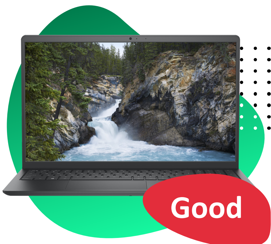
Dell Vostro 3520 i5 8GB Laptop