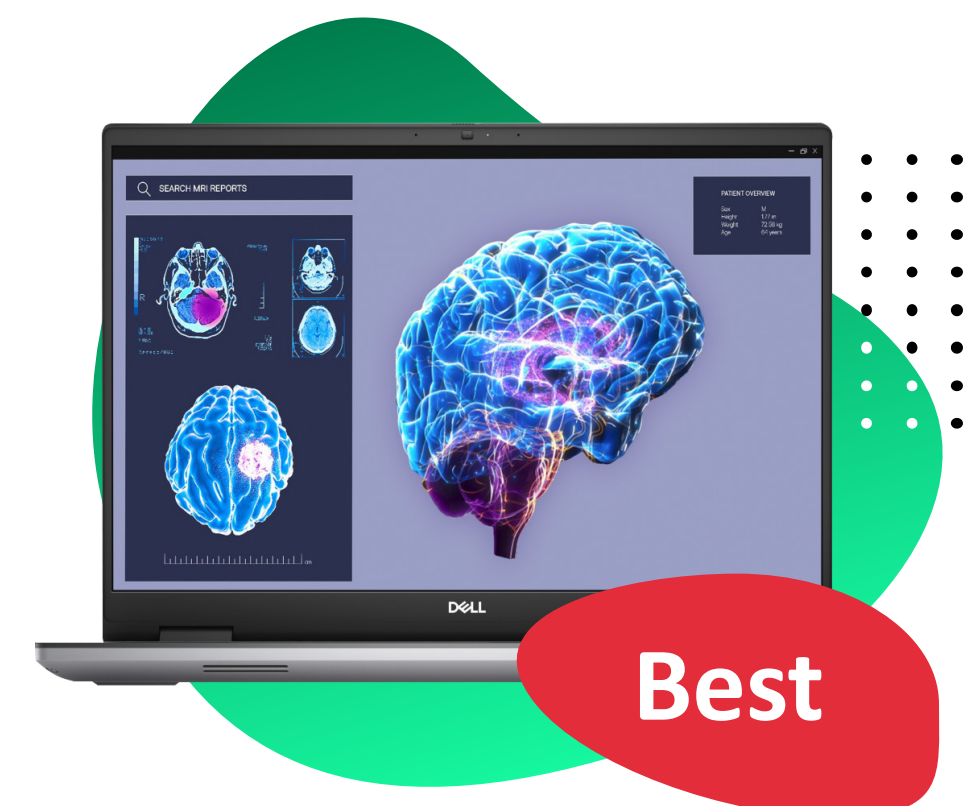
Dell Dell Precision 7680 i7 16GB RAM 512GB Laptop