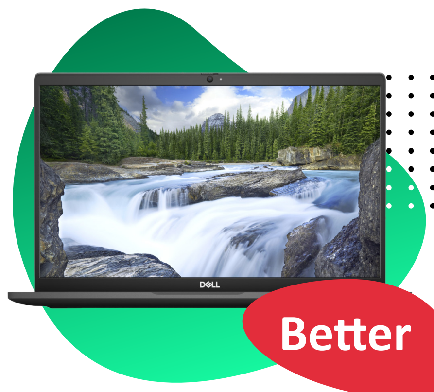
Dell Latitude 7430 i7 16GB RAM 512GB Laptop