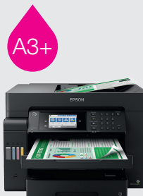
EcoTank ET-16600 Series