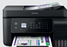
EcoTank ET-4700 Series