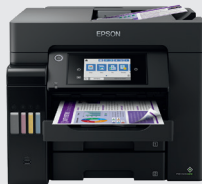
EcoTank ET-5800 Series