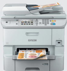
WF-6000 Pro Series