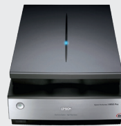
Perfection V850 Pro