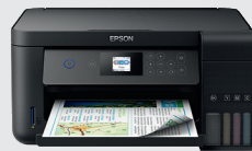
EcoTank ET-2750 Series