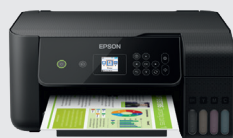
EcoTank ET-2720 Series