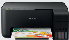
EcoTank ET-2710 Series