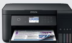
EcoTank ET-3700 Series