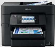
WF-4000 Pro Series