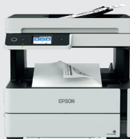
EcoTank ET-M3100 series