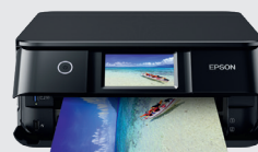
Photo XP-8600 Series