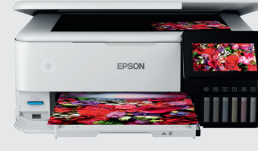
EcoTank ET-8500 Series