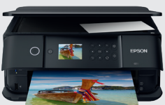
Premium XP-6100 Series