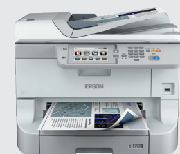
WF-8000 Pro Series