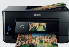
Premium XP-7100 Series