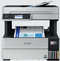
EcoTank ET-5100 Series